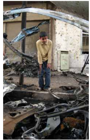
200 dead after fierce battle in Iraq.