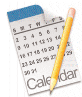
Check out The Hour's online community calendar for events in your area. Go to www.thehour.com .