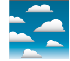
Mostly cloudy today with highs in the low 30s. Mostly cloudy tonight with lows in the 20s.