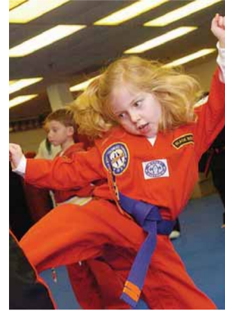
Karate Universe expands; future plans call for more growth.